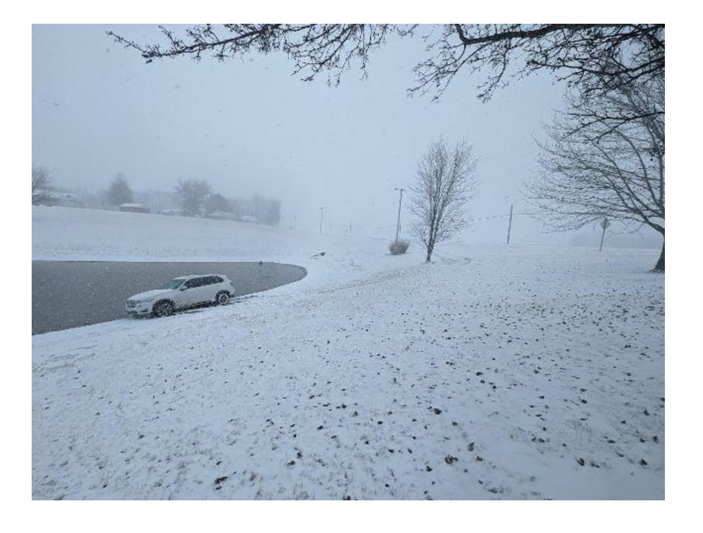
ALTON - Driving appeared treacherous at 2 p.m. Friday, Feb. 16, 2024, in the Alton region.

There were multiple reports of accidents and one driver was off the road on Illinois Route 3 near Brunaugh Construction and Design on Friday afternoon. The driver was not injured in this case, but it is an example that the roads are slippery around the region.