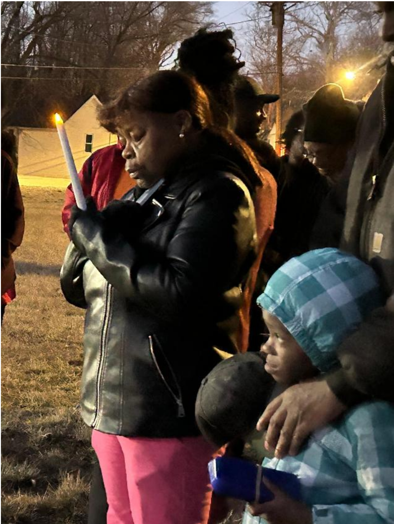
ALTON - It was an emotional night on Thursday, Feb. 8, 2024, for the friends, family and community members who gathered for a candlelight vigil in honor of a 13-year-old girl who was shot in Alton.