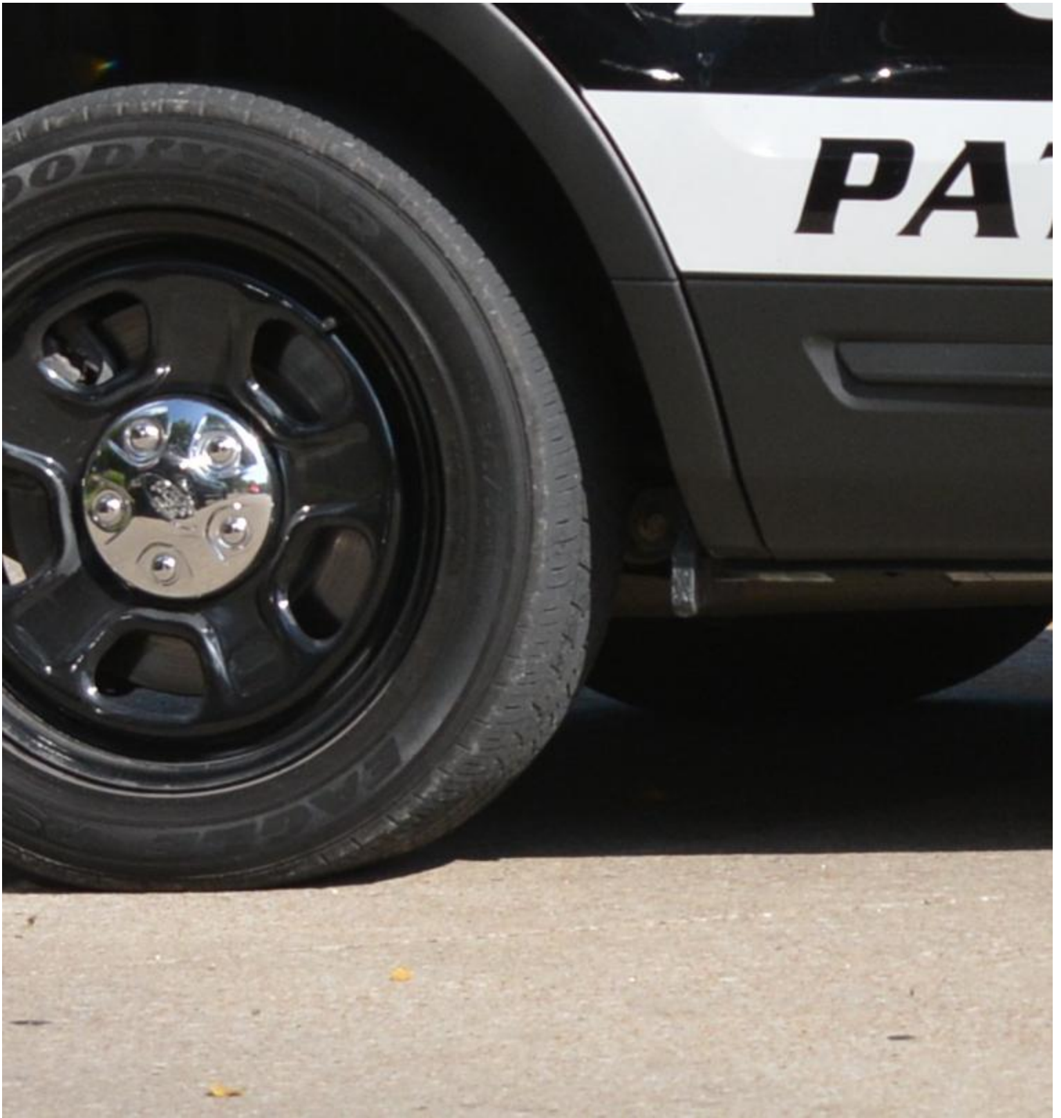
ALTON - A 19-year-old man from Alton has recently been charged with two felonies including vehicular invasion and robbery, according to recently filed Madison County Court documents.