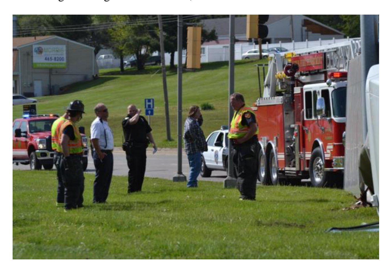
"It was a good thing no one was hurt," Sweetman added.