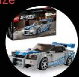
Remote control cars