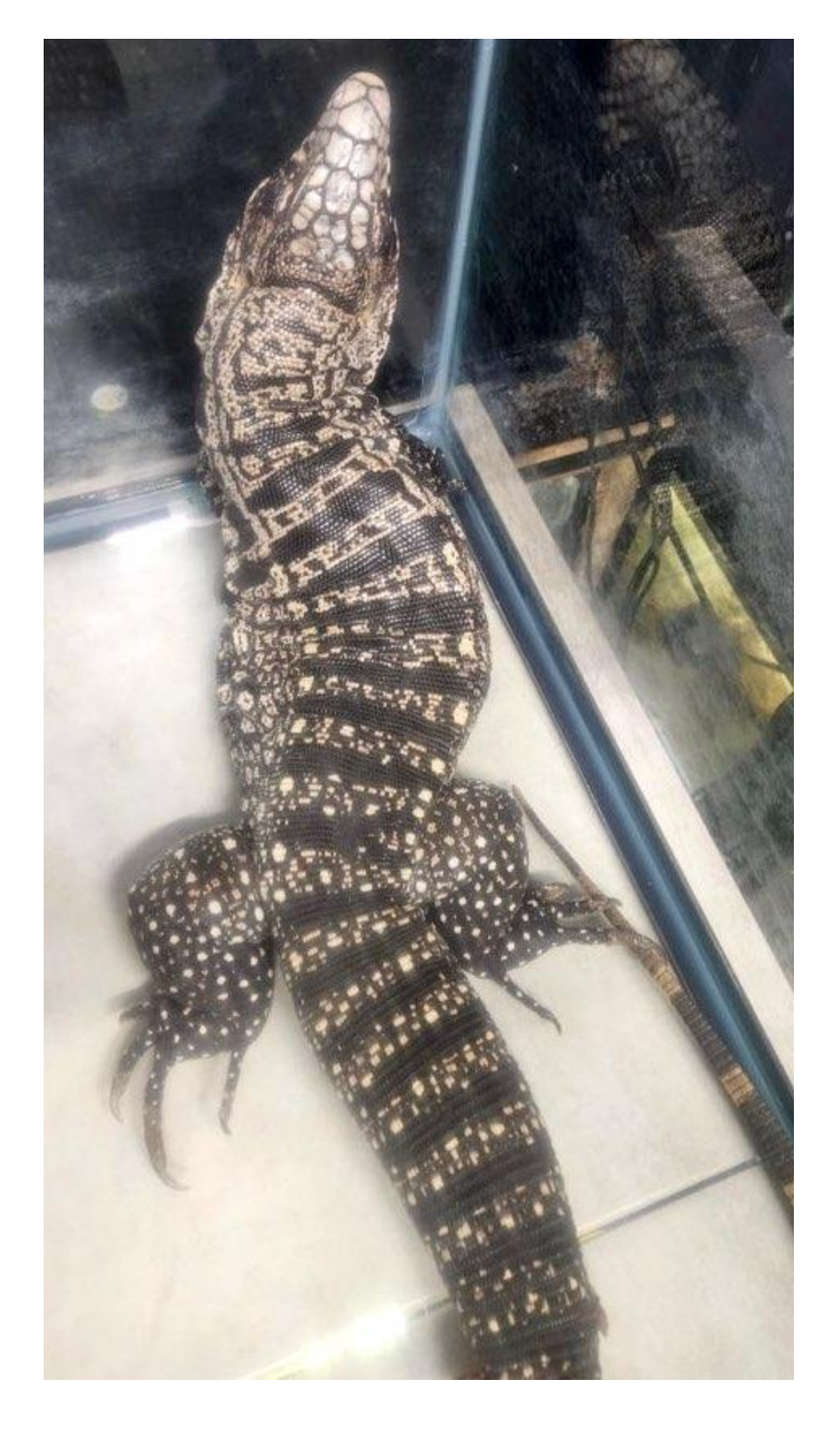
JERSEYVILLE - Jerseyville is a city where neighbors help neighbors in their times of need. A pet lizard was on the loose recently, slivering through the city before Midwest Tropical Fish responded to a few calls and rescued the Argentine black and white tegu.