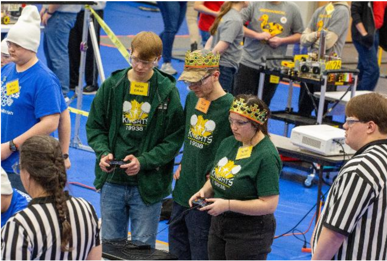
EDWARDSVILLE – Metro-East Lutheran High School’s robotics team is moving on to the FIRST Tech Challenge Illinois state championship after putting in a winning performance at the recent regional qualifying competition.