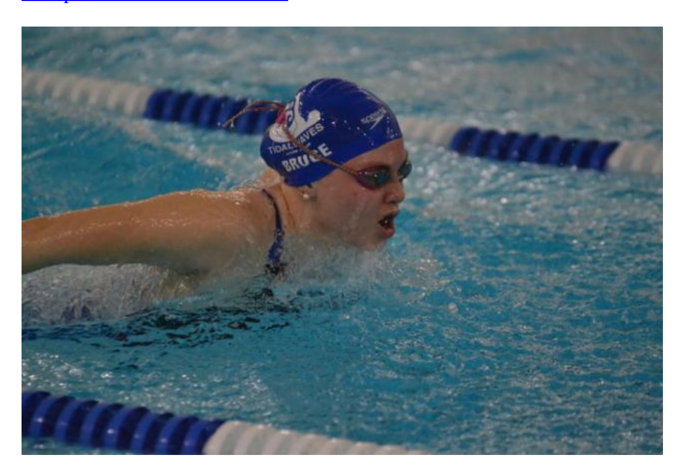
SEE HEARTLAND AREA MEET PHOTO GALLERY: <a href="http://www.edglentoday.com/photos/details.cfm?id=166">http://www.edglentoday.com/photos/details.cfm?id=166</a>

Rettle added that hosting the Heartland Area Swim Meet had worked out well.