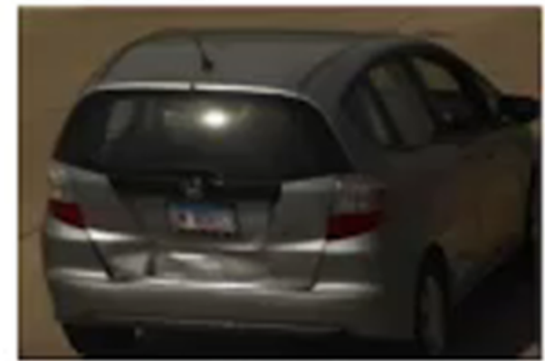
2010 Silver Hunda Fil