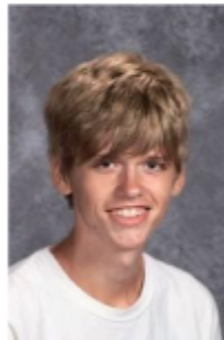
Justice Eldridge Band