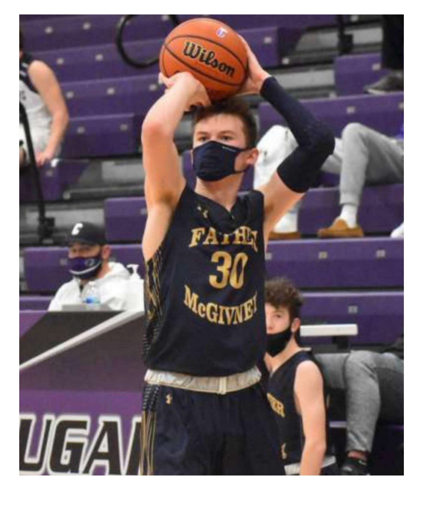
TUESDAY, FEBRUARY 8 SPORTS ROUNDUP BOYS BASKETBALL