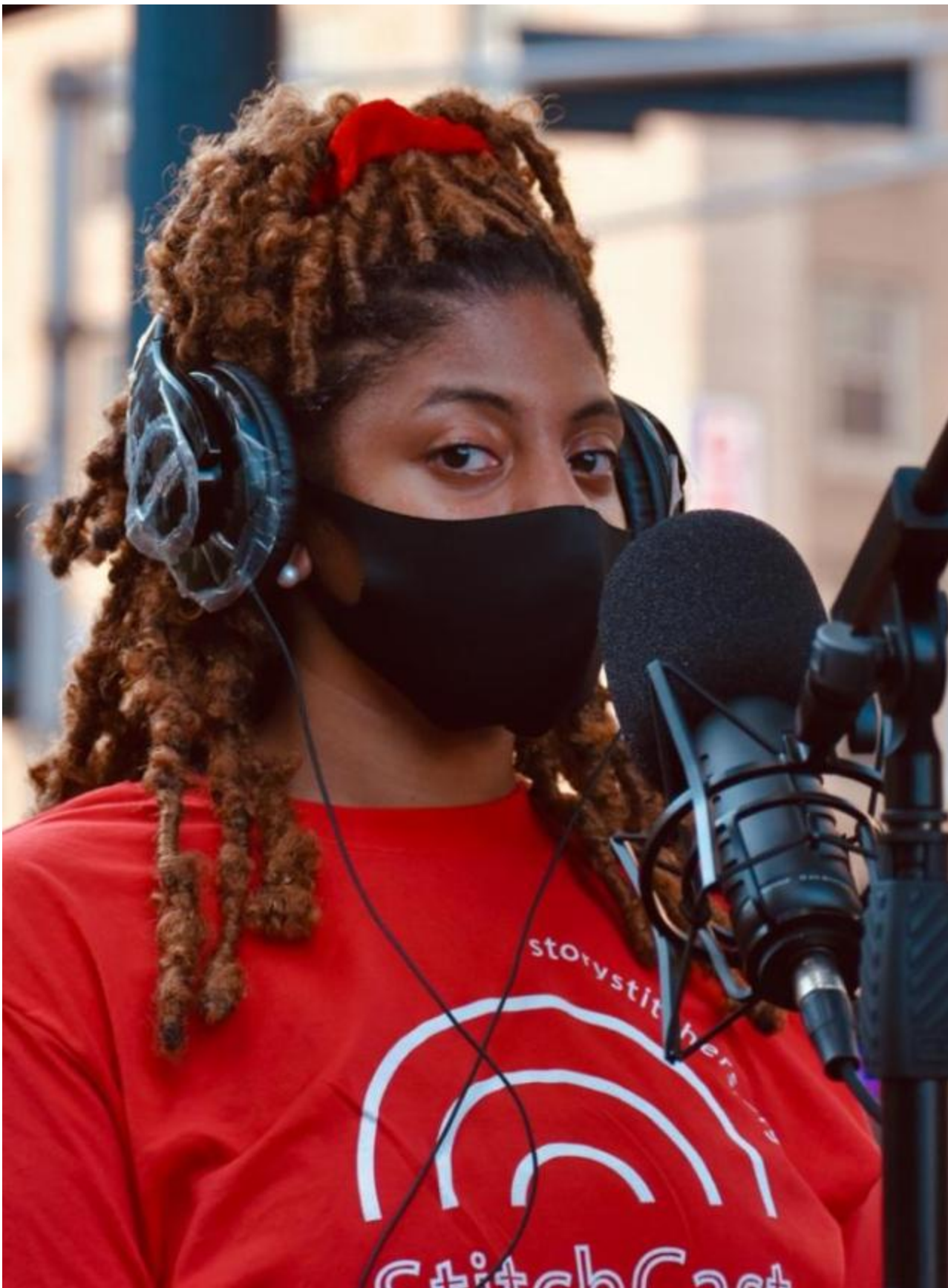
Youth, ages 16-24, lead meaningful dialogues that inspire original content in mentor-led workshops based on participants' lived experiences in economically disadvantaged, high crime areas. Podcasts focus on the streets, gun violence, and finding solutions to issues