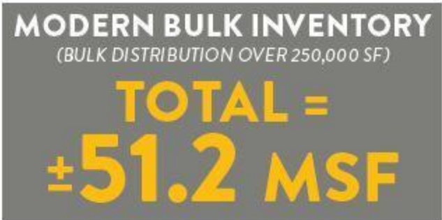
INVENTORY BREAKDOWN (BY BUILDING SF)