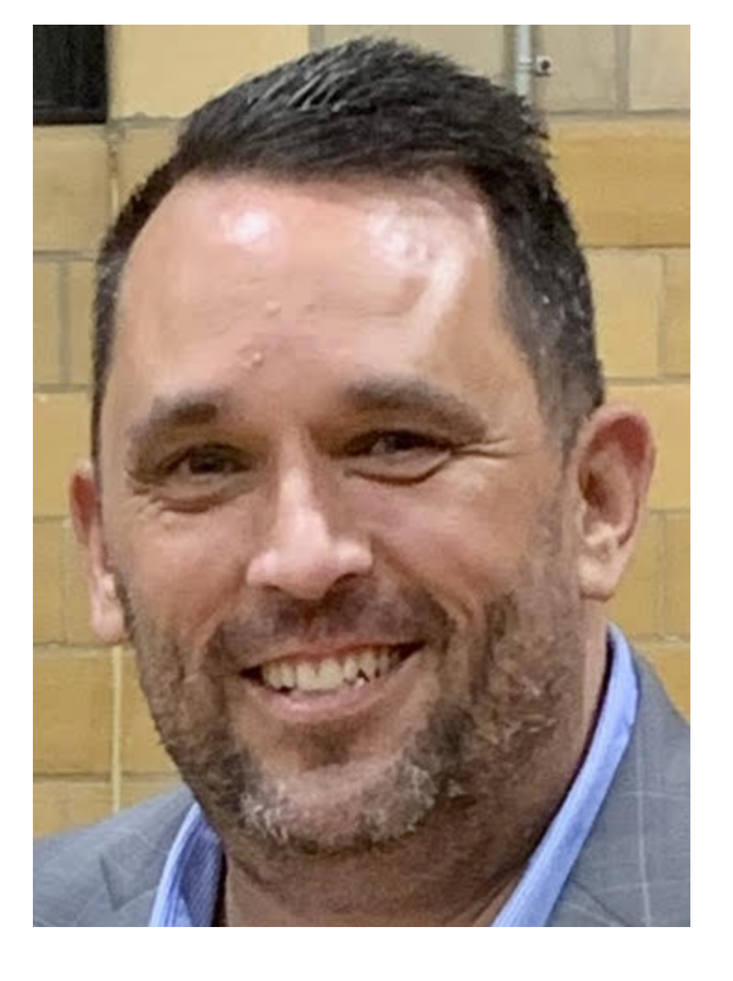
SOUTH ROXANA - A vehicle struck a power pole Saturday on Daniel Boone Trail in South Roxana, then the driver fled the vehicle and ran past the village's Police Chief