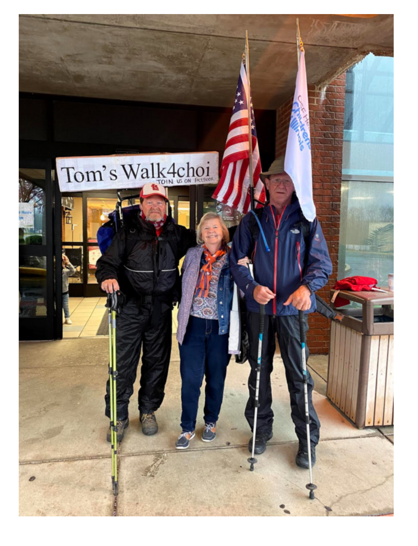
ALTON - A 75-year-old man on a very special mission for a children's hospital in Illinois began his 153-mile journey at OSF HealthCare Saint Anthony's Health Center in Alton on Saturday.