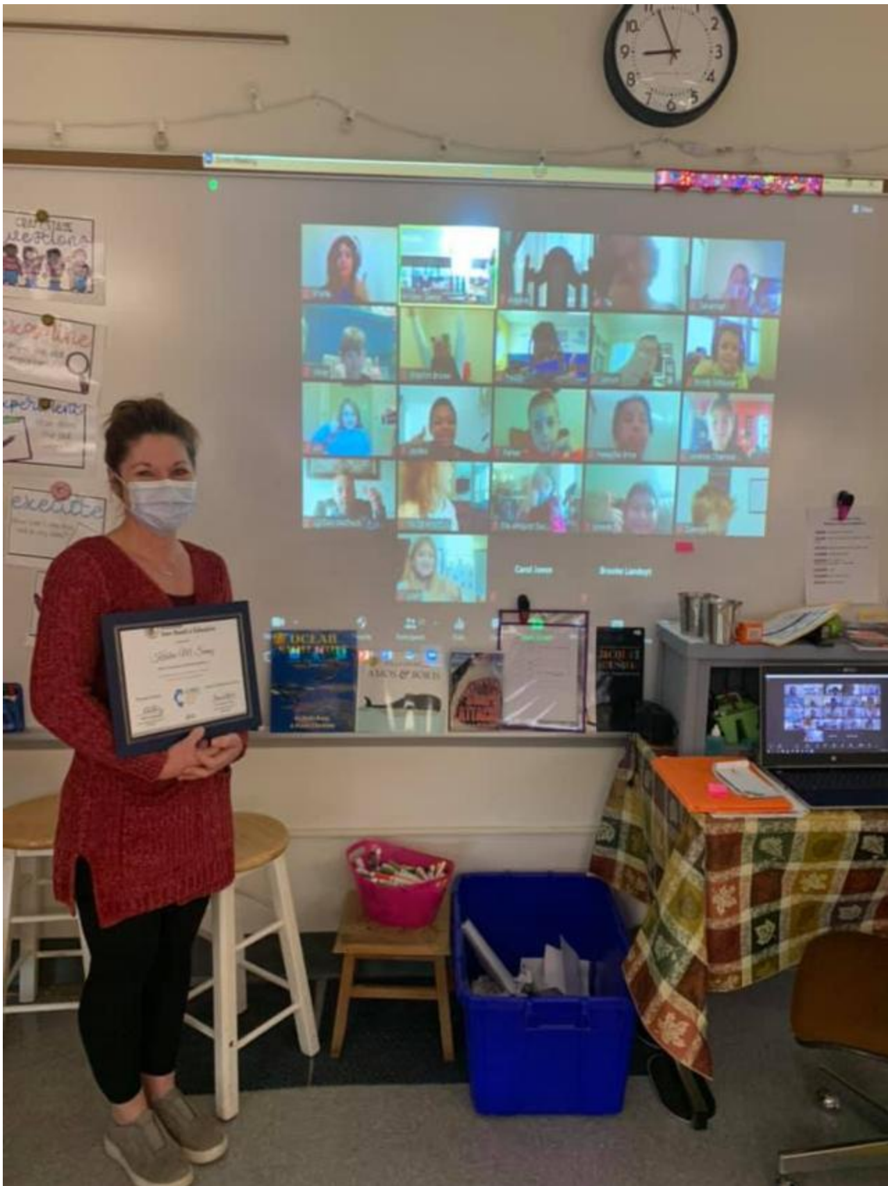
ALTON - Alton School District 11 had several recipients to Illinois “Those Who Excel Awards.”