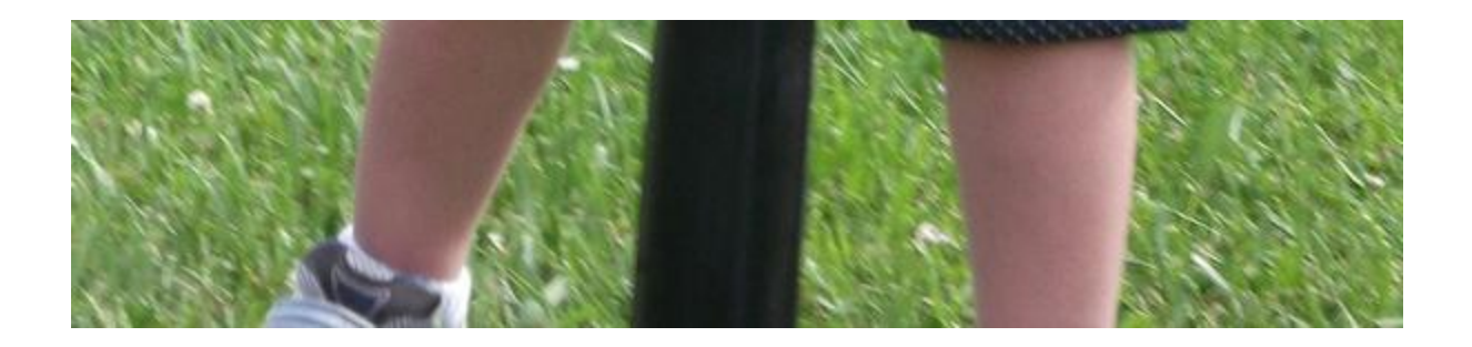
Photo: Nolan Goetten concentrates on hitting the ball during the 2013 JPRD Itty Bitty T-Ball program.