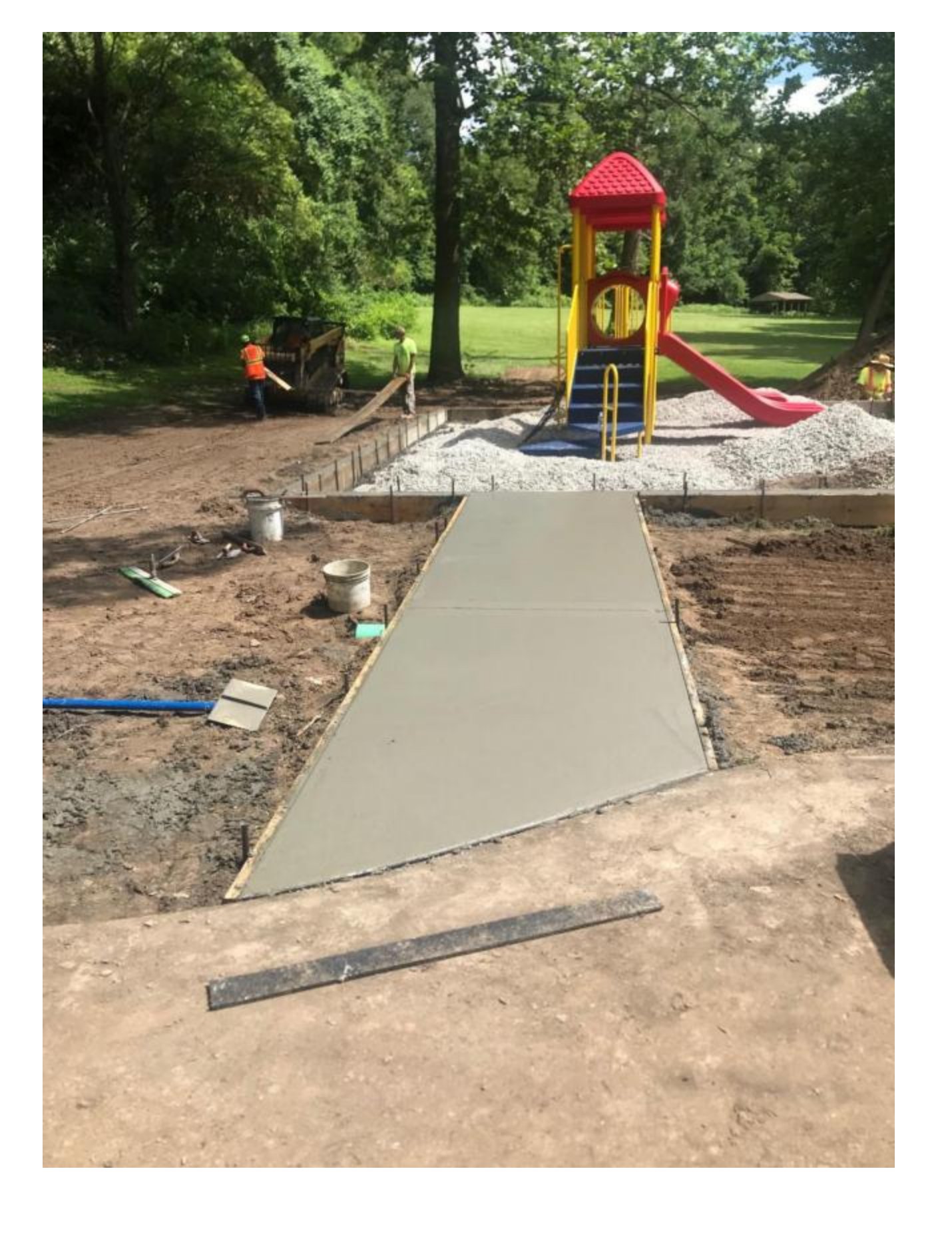
ALTON - Gordon Moore Park renovations appear right on track, despite the COVID-19 Pandemic. The most recent phase of the renovations has been the revitalization of the Gordon Moore Park turf soccer fields. The park has two new turf surfaces in fields three