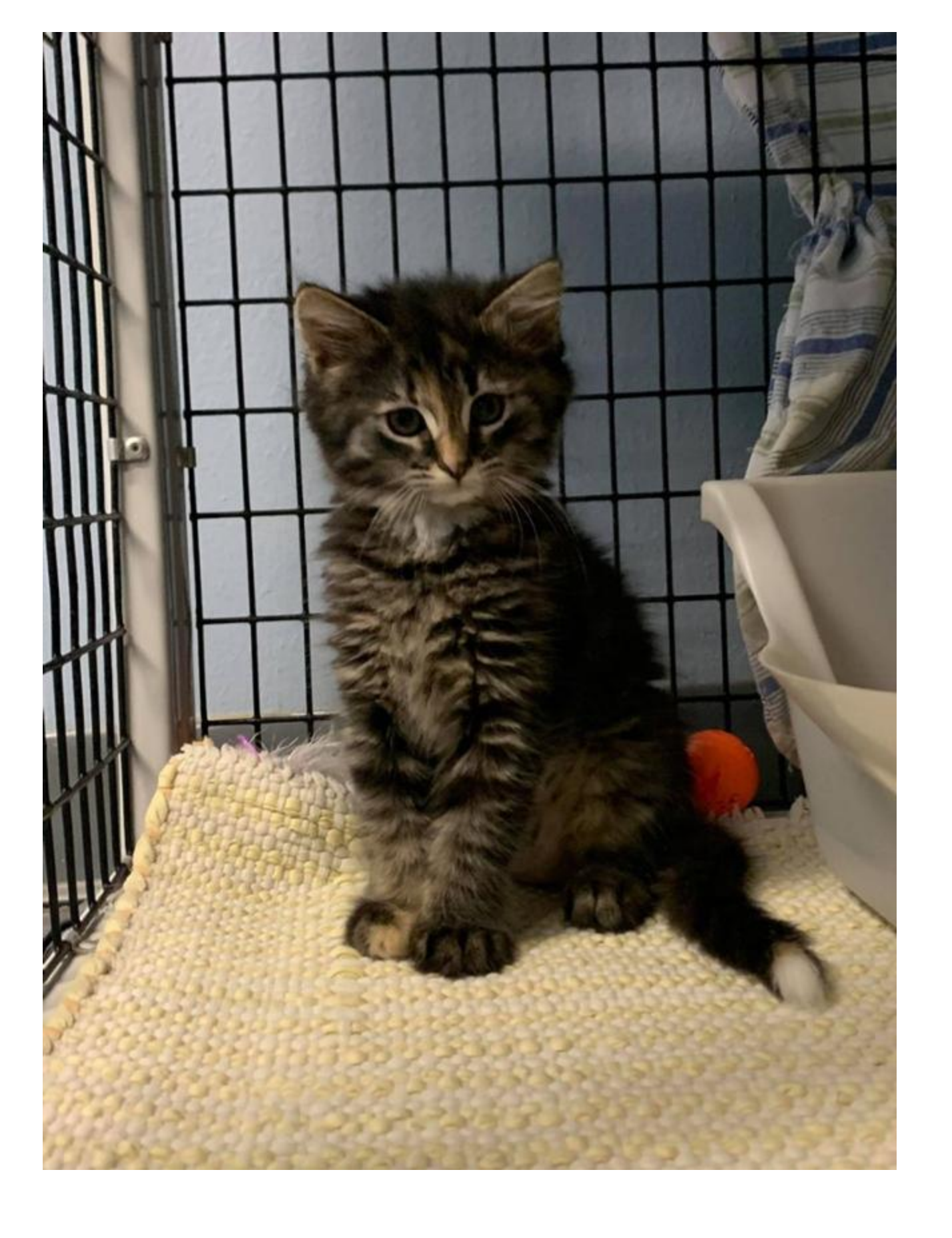
EDWARDSVILLE — The Metro East Humane Society (MEHS) is excited to announce they have helped over 1,000 animals so far in 2020: 525 animals have found their forever homes through adoptions, 200 cats have been served through the TNR