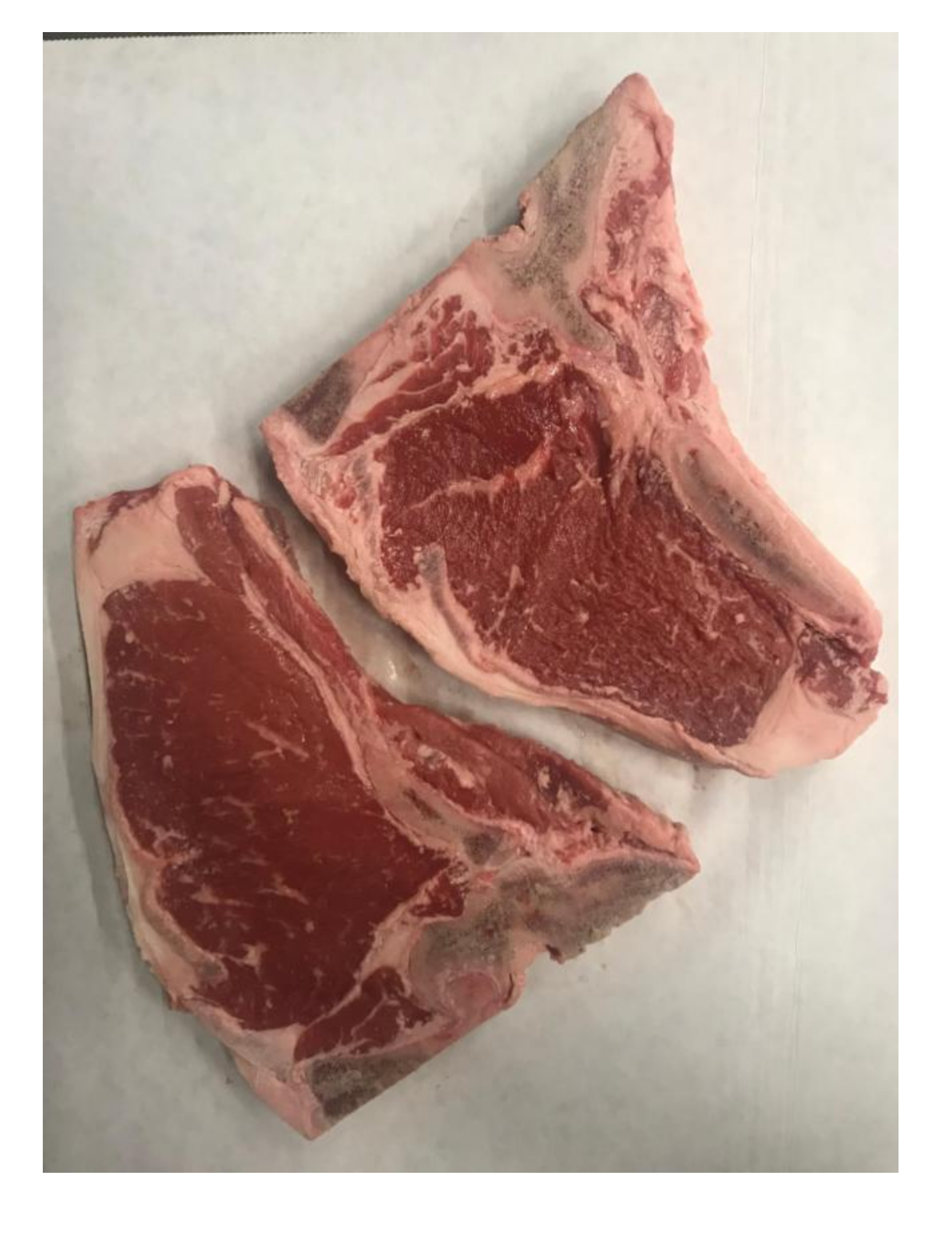
EDWARDSVILLE - Bagley Farms Meat Market has opened a convenient location at 1059 Century Drive in Edwardsville just in time for the heavy summer barbecue season.