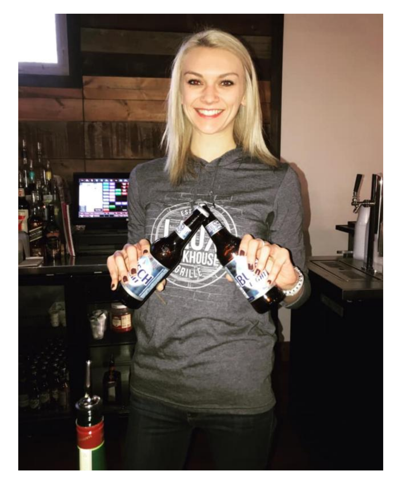
BETHALTO - The Brick Hall at 212 N. Prairie St. in Bethalto has become a strong business force as a performance and event venue, a wedding venue and restaurant.