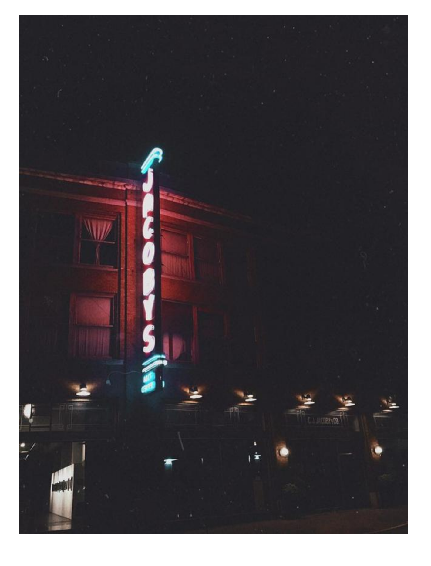
ALTON – Warm Soda Magazine will be hosting a spooky art show this coming weekend in the theme of this spooky season.