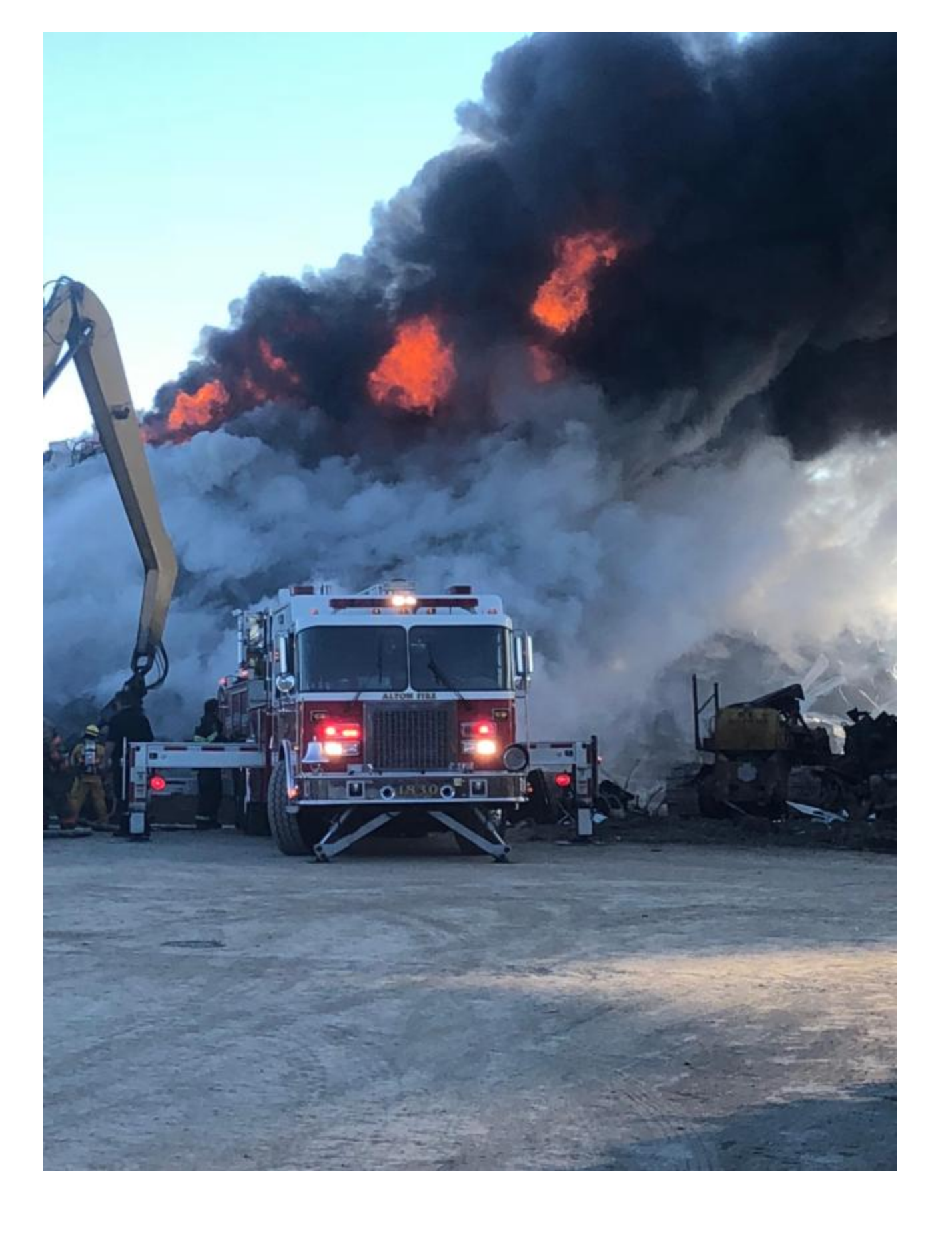
BRIGHTON - Multiple fire departments have responded to a massive fire at MAW Salvage at 1020 Fosterburg Road in Brighton Tuesday morning.