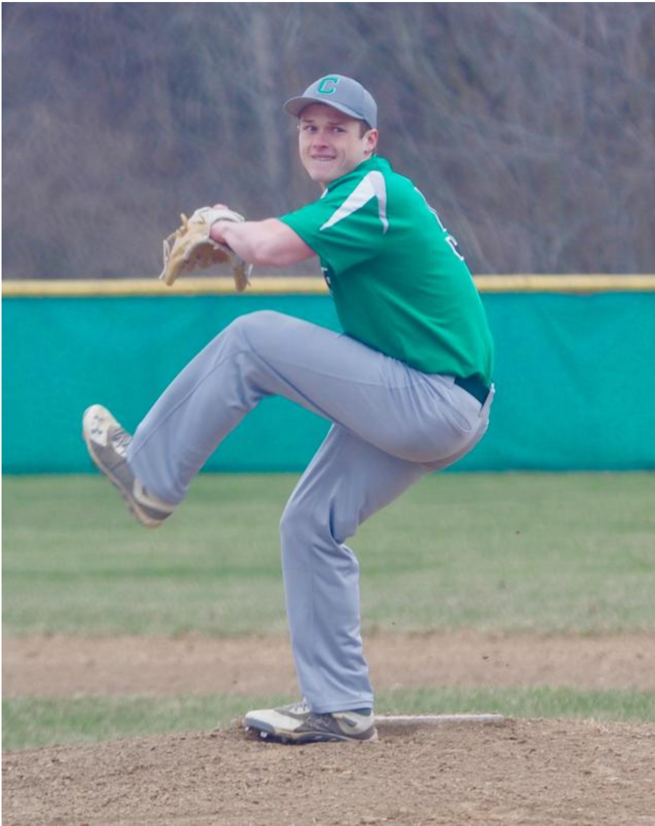
CARROLLTON - It was a pitcher's duel through five innings, but the Brown County Hornets broke through with two runs in the top of the sixth inning and three more in the seventh to make the score 5-0.