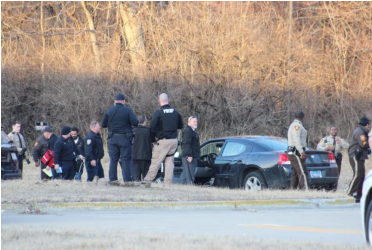
WOOD RIVER - Several area police departments were involved in a chase originating from St. Louis late Wednesday afternoon.