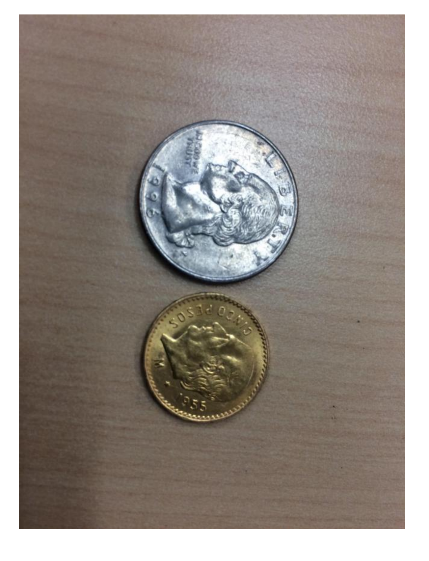
ALTON - East Alton First United Methodist Church appears to be a magnet for gold coins in the Alton Salvation Army campaign.