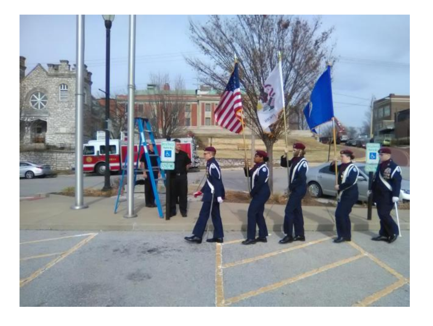
ALTON - Alton was one of many cities across the State of Illinois starting the celebration of the state's bicentennial.

Illinois was made a state on Dec. 3, 1818 - exactly 199 years ago. Because of that, the state is celebrating its 200th birthday all year. The conclusion of this celebration will occur on Dec. 3, 2018, the actual 200th anniversary of Illinois's statehood. Cities across the state, including Alton, celebrated this historic event with the ceremonial raising of the Illinois bicentennial flag Monday.