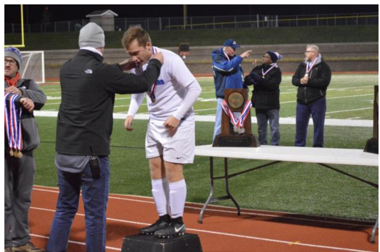
For a time,

the teams looked like they were going to go to a penalty-kick shootout to decide the winner before the Titans were whistled for a direct-kick foul just outside the penalty area; that's when Ngma stepped up and drove the ball into the back of the net for the match-winner.