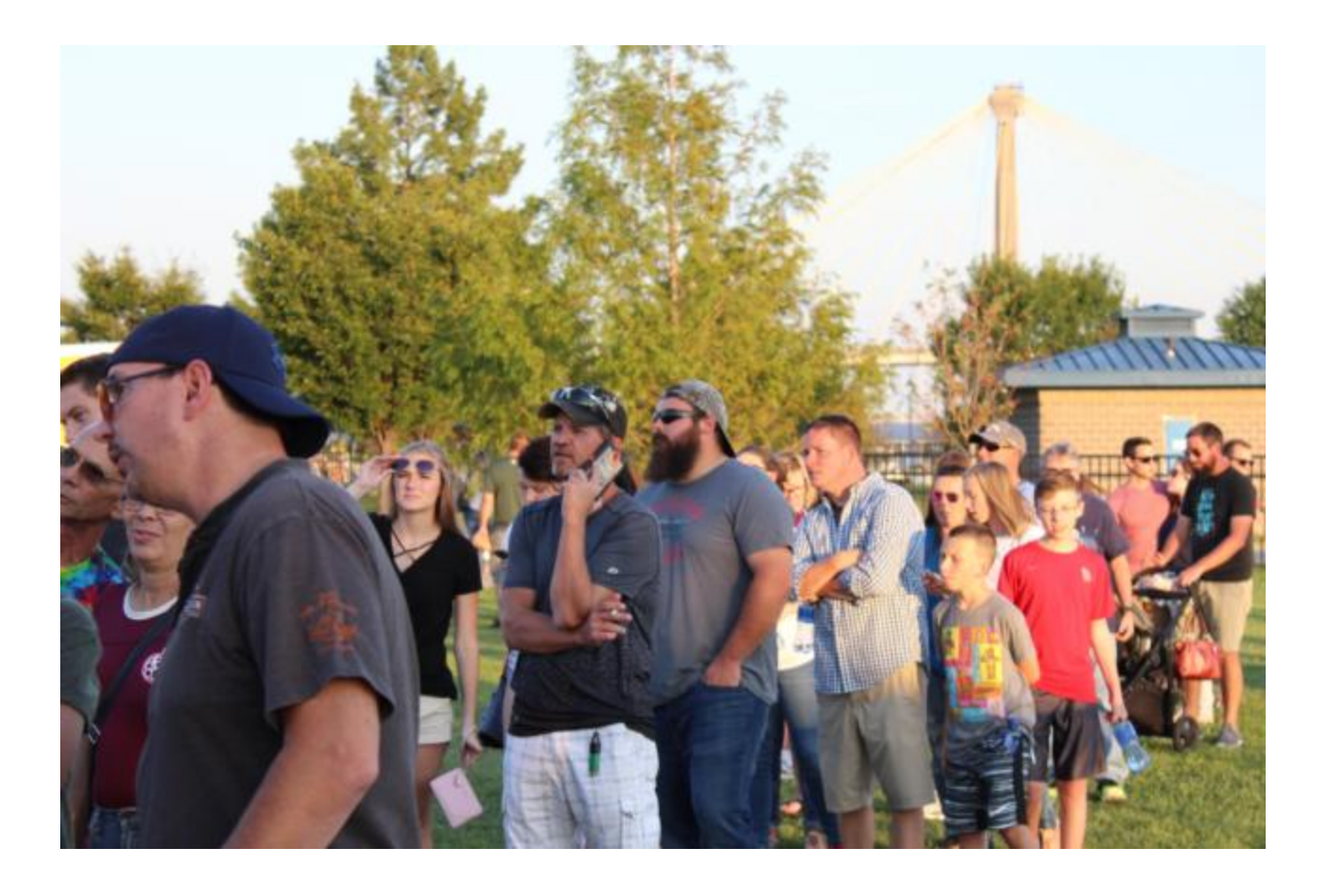
ALTON - The third annual Alton Food Truck Festival brought in thousands of people to the city's riverfront at the Alton Amphitheater Saturday evening.