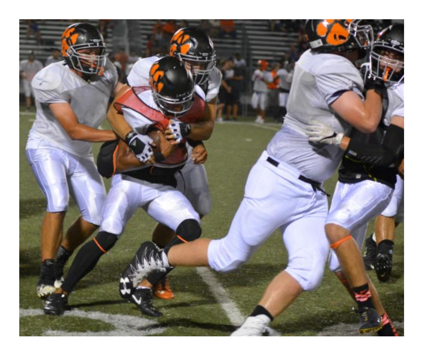
EDWARDSVILLE — The Edwardsville Tigers football team had a very successful season in 2016, and look to be ready for more success in the 2017.