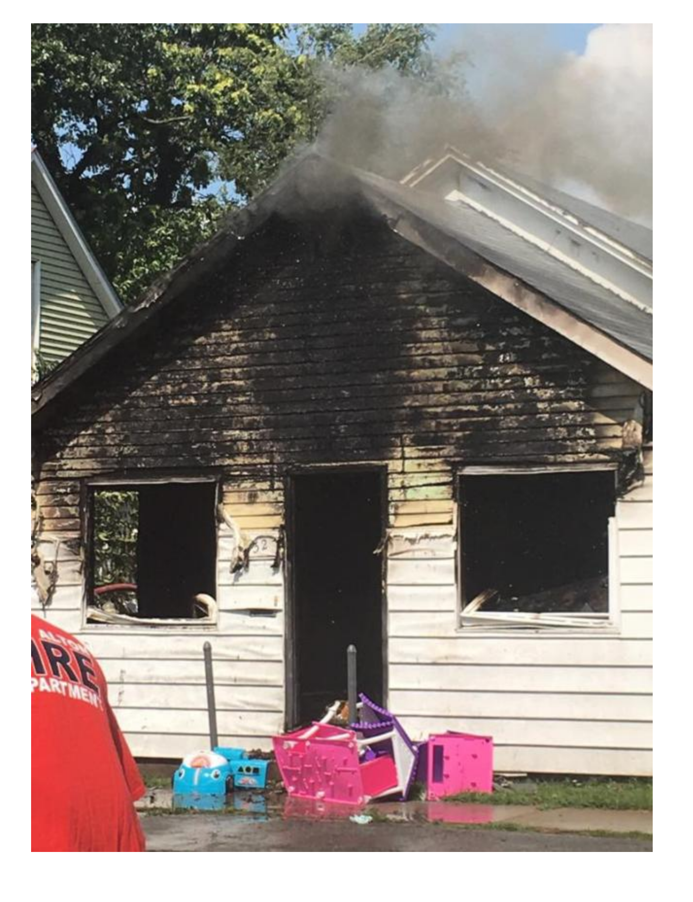
EAST ALTON - The East Alton Fire Department received a fire call in the 300 block of Job Street in East Alton at 3:27 p.m. and was on the scene by 3:29 p.m. to face an intense blaze that already occupied half the home.