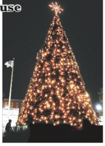
Riverbender.com 200 W 3rd St, Alton, IL 62002

-FREE trolley ride between the corner of 3rd & Belle and Lincoln-Douglas Square.