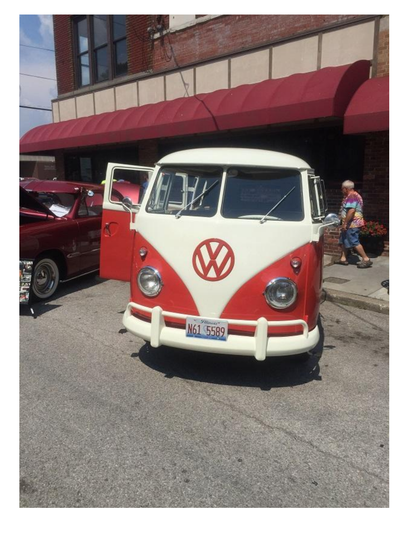
ALTON - Only certain cars could be on the streets of Downtown Alton Sunday afternoon, and one of them was the Batmobile.

For the 19th year, the All Wheels Drive-In Car Show sponsored by Alton Main Street and the Time Machines Unlimited Car Club was presented in downtown Alton. The