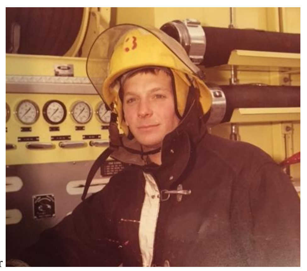
"It is almost impossible for

people who have mental and emotional issues and need help to get help," she said. "Danny was hospitalized many times. I am very sensitive to people who need help with these kinds of issues."