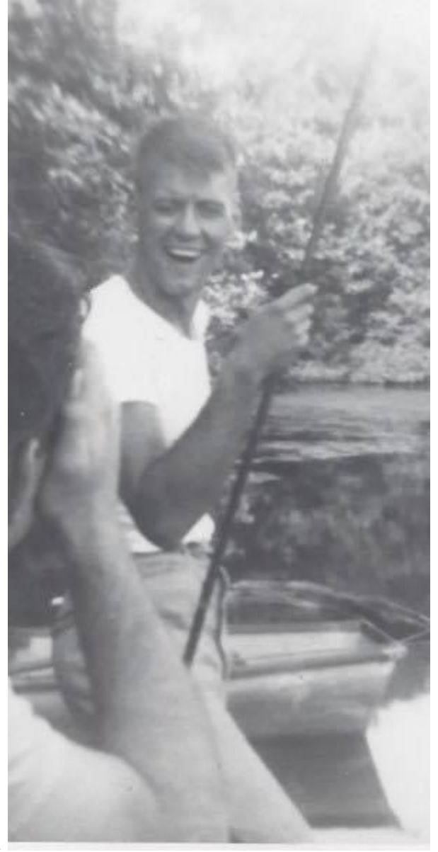
something that he had

But on that glorious day his spirits were lifted, when he was out on the water doing